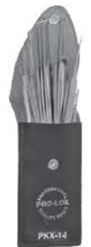
JV# 314-707 MFG# PKX-14

The most popular pick set comes with nine picks, a broken key extractor, and four tension wrenches, all in a soft luggage quality leather snap case.