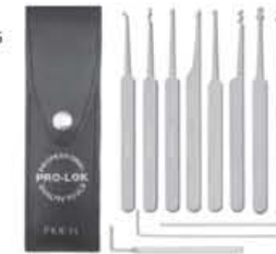
JV# 314-705 MFG# PKX-11

Set includes 8 picks with stainless steel handles and 3 tension wrenches in a soft luggage quality leather snap case.