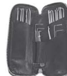
JV# 314-733 MFG# PKX-20

The MD Set features a zippered leather case with 20 picks and tension wrenches.