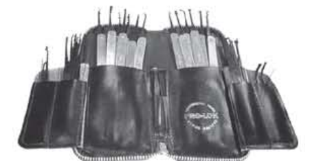
JV# 314-712 MFG# PKX-32

Large set includes a variety of tempered stainless steel hooks, rakes, balls, diamonds, key extractors, and tension wrenches.