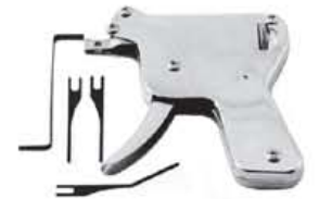
JV# 314-700 MFG# PKXGUNM

The PKX-GUN-M, Manual Pick Gun, is the best pick gun available. Used by locksmiths everywhere, the pick gun allows you to pick a wide variety of locks. Included with the Manual Pick Gun are three picks and a tension wrench.