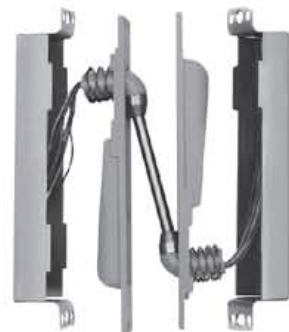
JV# 476-325 MFG# EPT-2-SP28

Two 18 gauge wires, 2 amp Finish - SP28 (sprayed aluminum)